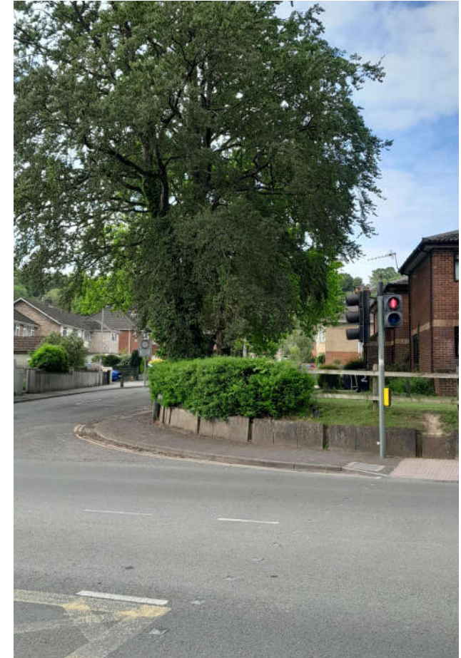
Traffic light crossing nr Saxon Road