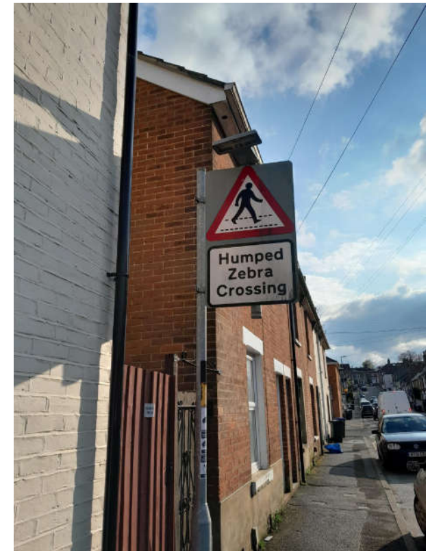
Ashley Road, Salisbury